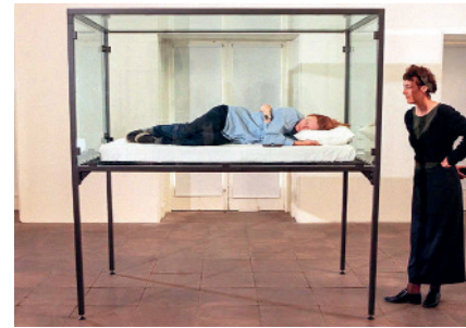
Clockwise from top left: Swinton in The Human Voice (2020) directed by Pedro Almodóvar based on a play by Jean Cocteau; in Orlando (1992) directed by Sally Potter based on a book by Virginia Woolf; in an art installation in 1995; with her Oscar for her role in Michael Clayton in 2008.

screen 14 adaptation of Virginia Woolf's novel about a young nobleman and poet who changes sex and lives for centuries seemed perfect for her. The novel and film tackle 15 themes such as liberty and gender identity 16 , but it is also a journey 17 through four hundred years of English history.